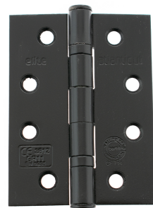
Product Finish Pictured: Matt Black