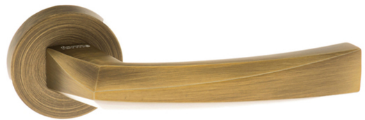
Finish Photographed: Yester Bronze (YB)