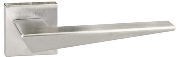
Finish Photographed: Satin Chrome